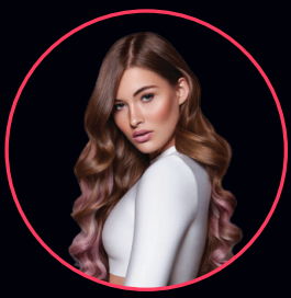
Hydrate Conditioning Treatment