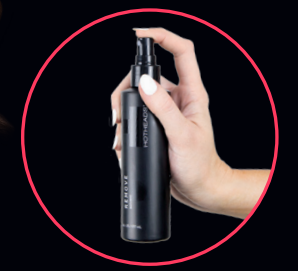
Extension Removal & Reapplication